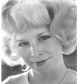
Candy Clark Debbie in American Graffiti