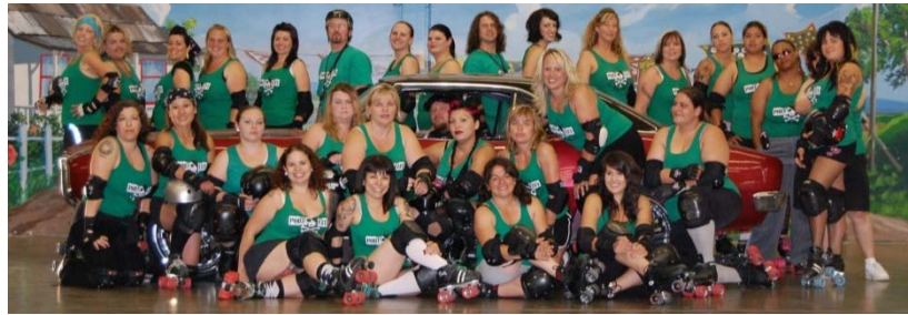
PORT CITY ROLLER GIRLS